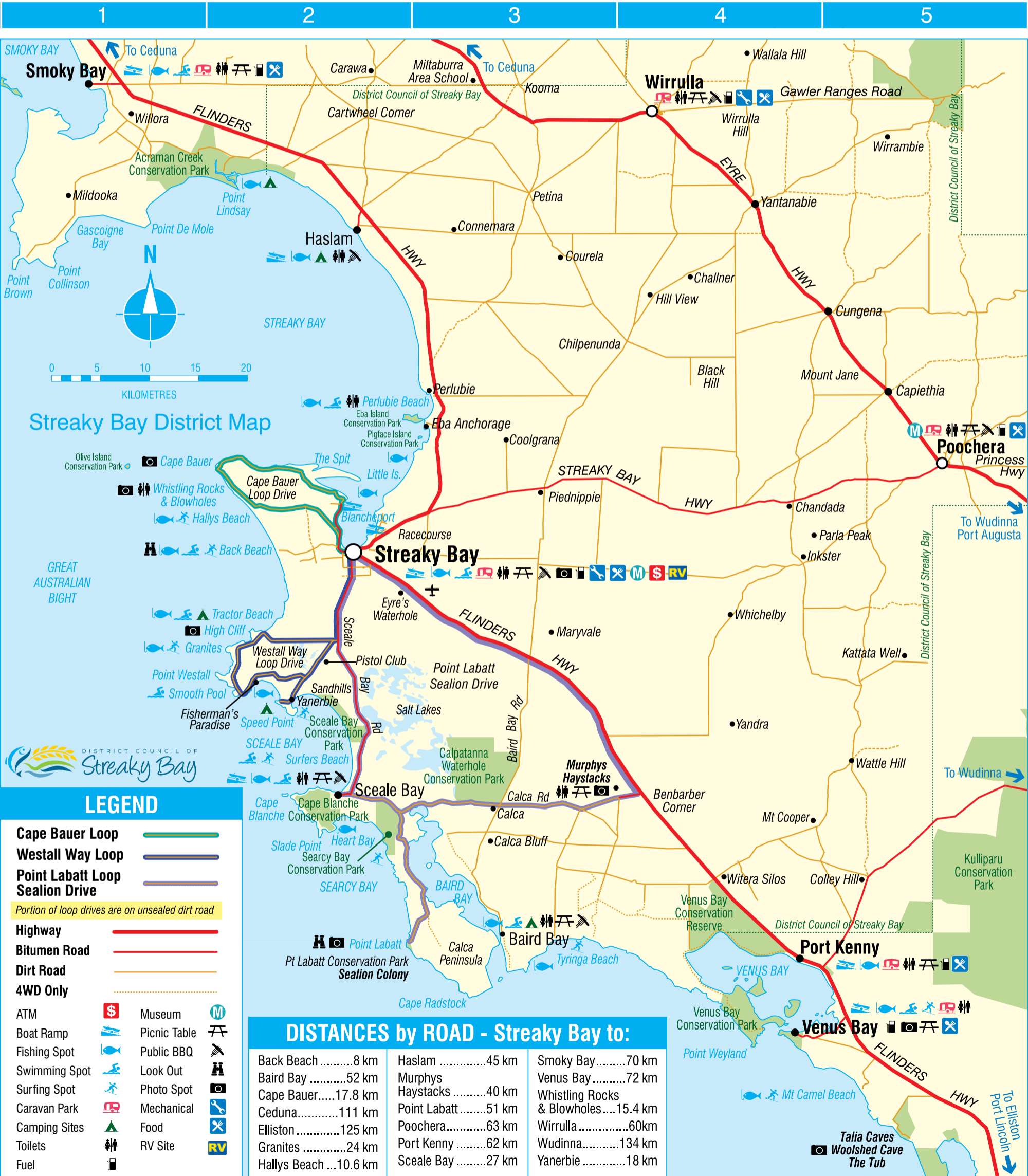
Streaky Bay District Map